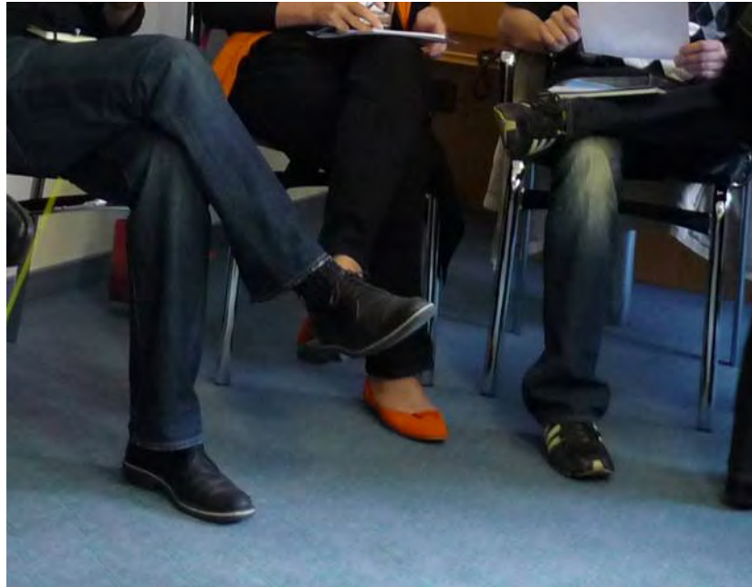
Workshop participants answering these questions

What abilities and resources do we have?